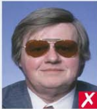
dark tinted lenses