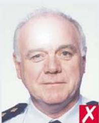
flash reflection on skin