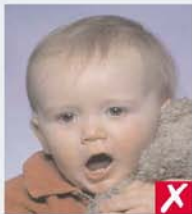
mouth open and toy too close to face