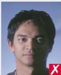
shadows across face