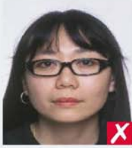
frames too heavy