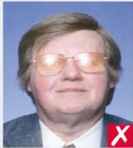
flash reflection on lenses