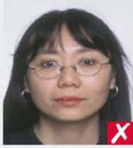
frames covering eyes