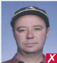
wearing a cap