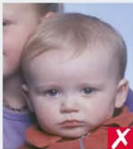
shows another person