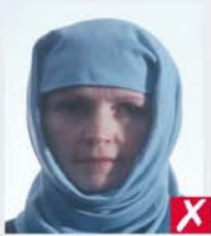
shadows across face