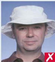
wearing a hat