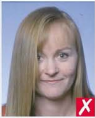
hair across eyes