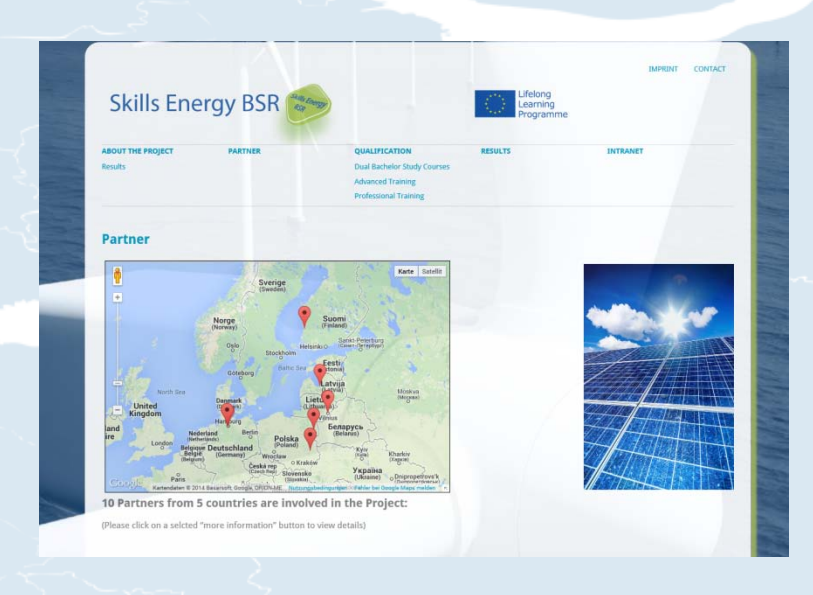
Sector Skill Alliance